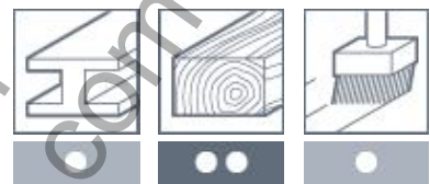
Metal Wood Lacquer